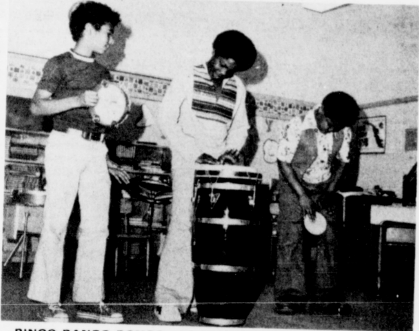
BINGO BANGO BONGO - Rhythms on the bongo drums are included in the music program for summer group singing and dramatics also will be on the agenda.

The newest look in summer excitement is fashioned for the youth of Portland's urban community, and can be seen beginning June 23, at the King Neighborhood Facility, 4815 N.E. 7th Avenue, where staging is by Urban 4-H Center.