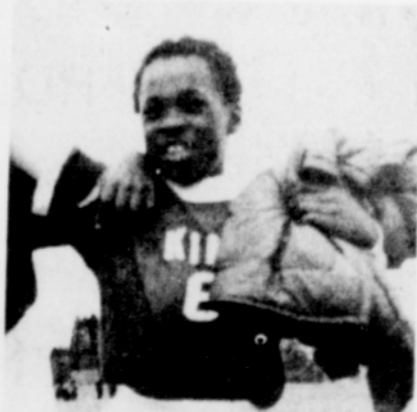
SPORTS - Youngsters enjoy a popular sports program supervised by teen leaders.