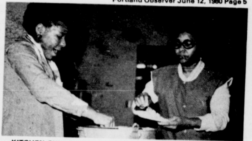
KITCHEN SKILLS - 4-H volunteers are always part of the team. If you have a few hours to spare, call 287-1770 for summer volunteer services.