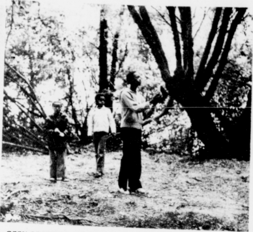
OPEN COUNTRY - Camping out at the 4-H outdoor center in Salem is on the agenda again this year.