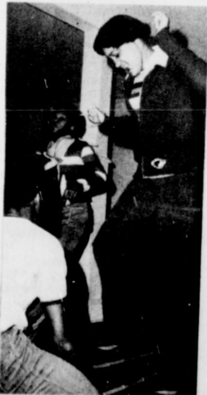
STEP LIVELY - indoor sports and dancing are part of the summer 4-H program.