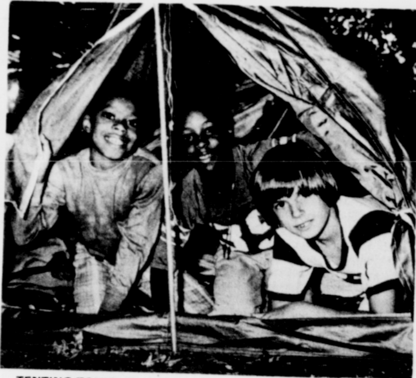
TENTING TONIGHT - There's nothing more fun than tenting in the great outdoors and roughing it with a fish pole and hiking gear.