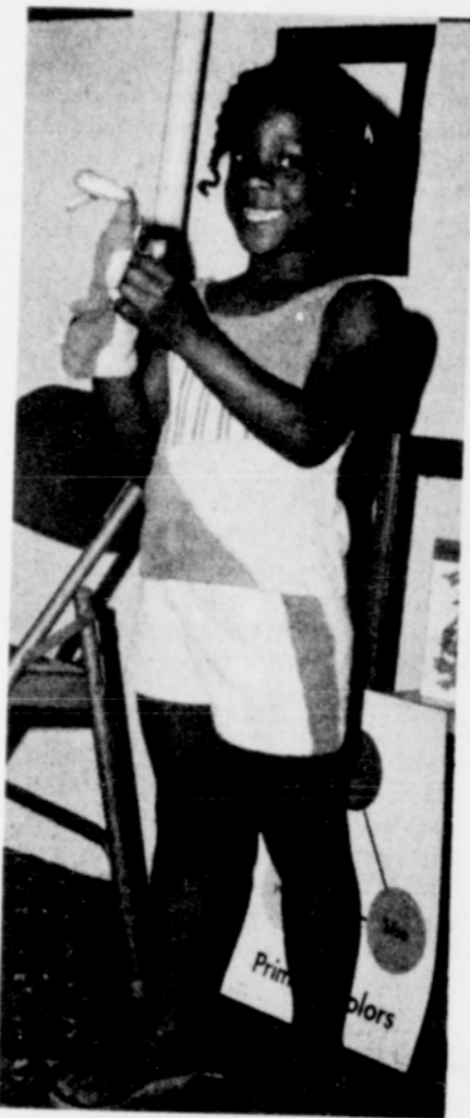
IT'S AN ACT - Puppetry takes the spotlight when 4-H puppeteers are on stage. Summer club members will learn how to put on their own show.

For youngsters enrolled in the summer program, three pick-up points will be established to provide transportation to and from the King Center for those who cannot otherwise attend. The daily program will include snacks and lunch at noon. The program is cost free, except for special tours where there is a nominal fee.