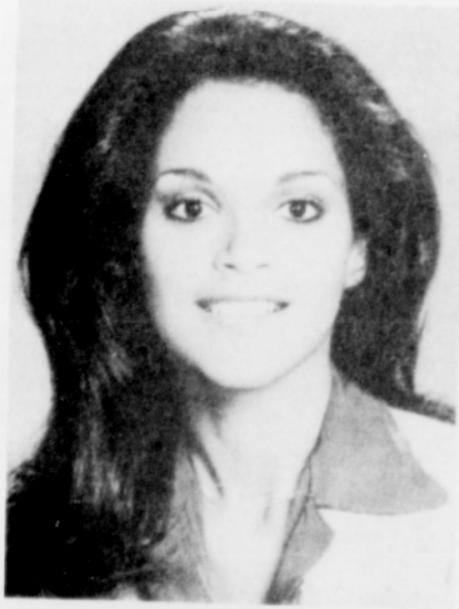
JAYNE KENNEDY, Star of "NFL Today."