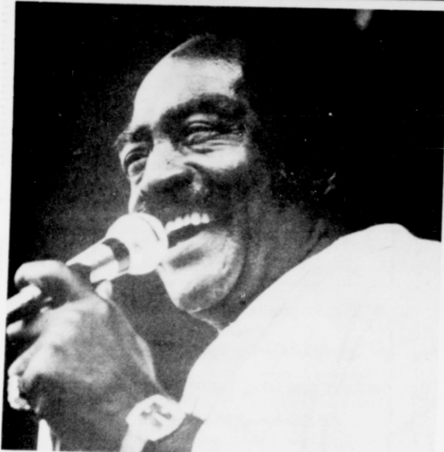
Jimmy Witherspoon and his golden voice will be at Jazz de Opus 33 N.W. 2nd Ave., June 15th. Advance tickets now being sold at: Jazz De Opus, Frederick & Nelson's downtown and Music Millennium, 3158 E. Burnside. Price of tickets: 6:00 p.m., $6.50 - 10:00 p.m., $6.50.