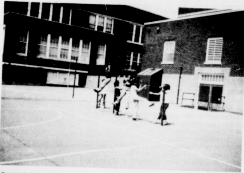
Boise School playground