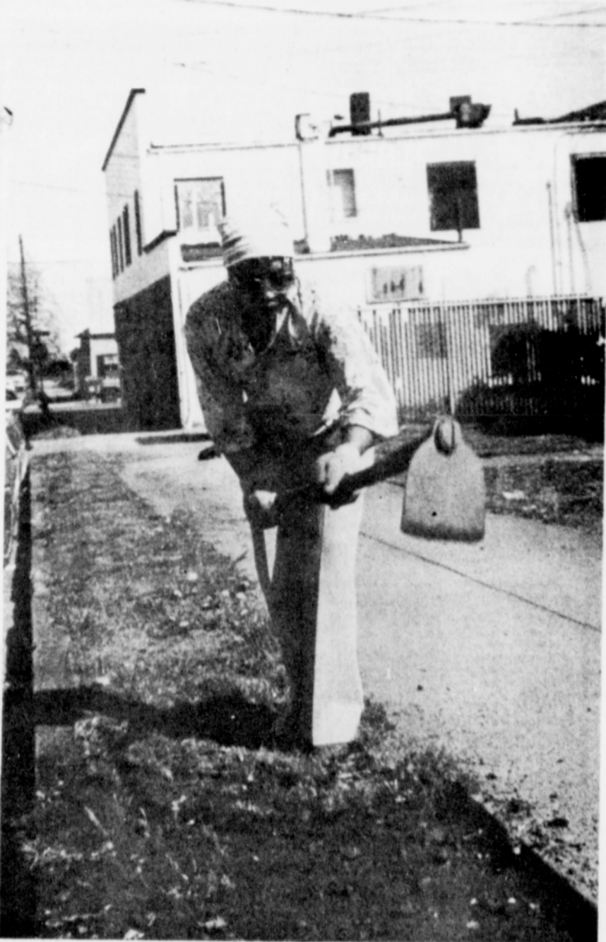
Warm spring weather inspired neighborhood resident to get out in the sunshine and do needed yard work.

The above information will remain on the premises of the library for reference.