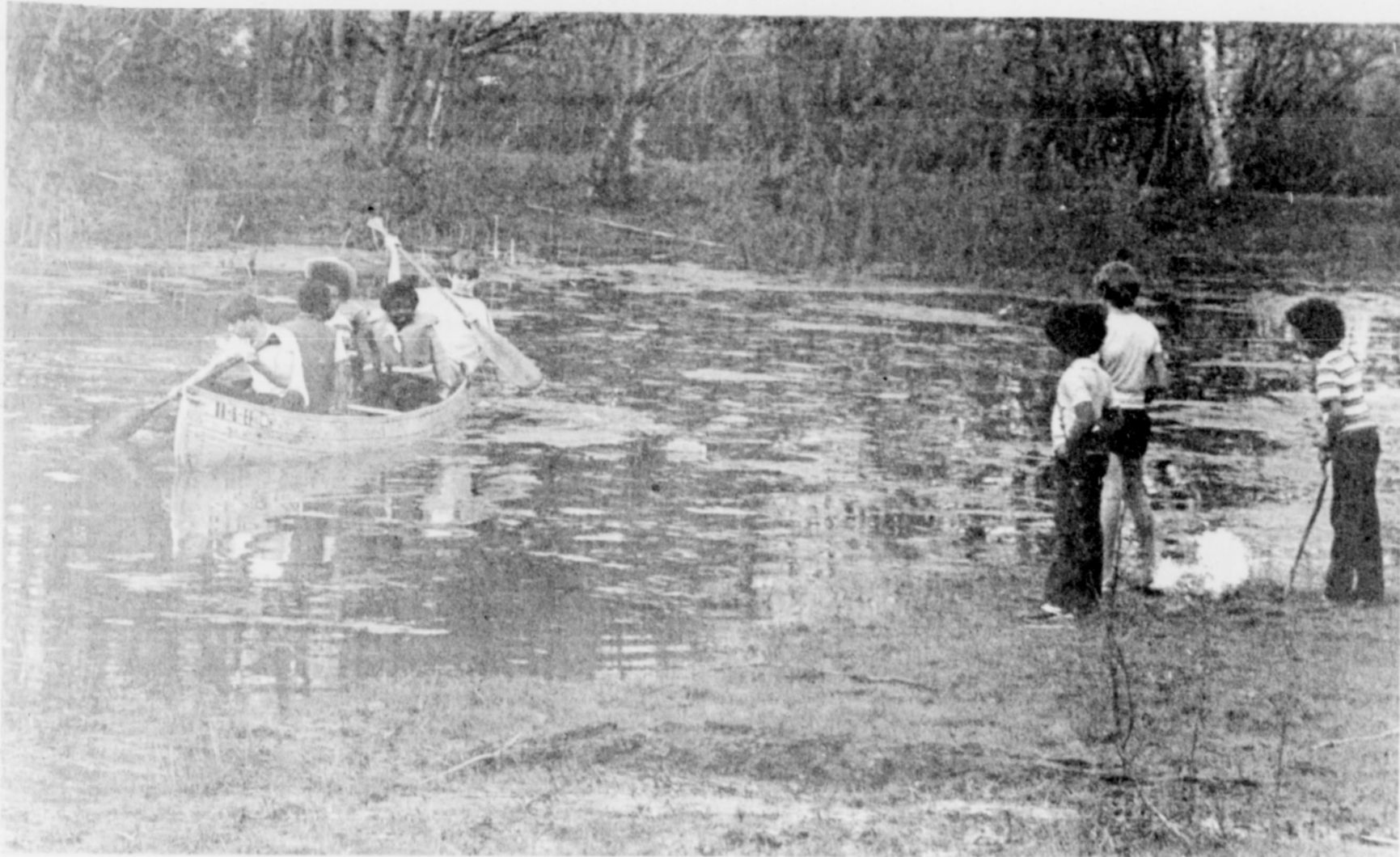
Three hundred children and their parents visited Big Sky Youth Camp on a trip sponsored by the Bible Church. Activities included horseback riding, canoeing, fishing, eating and all kinds of fun.