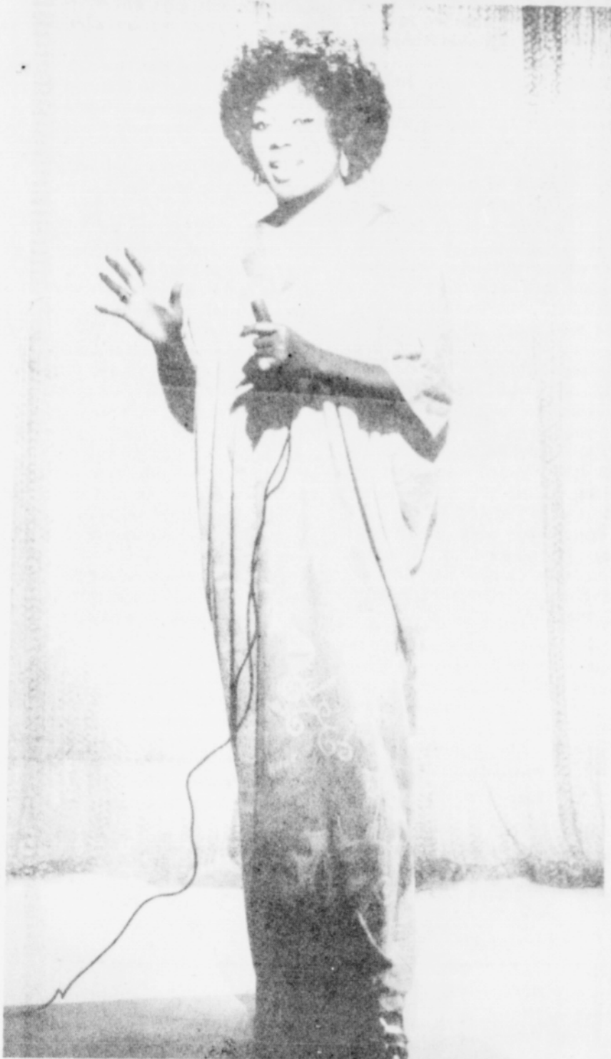
Don't miss Sarah Vaughan at the Civic Auditorium. Patron tickets, at $50, are available through ARTQUAKE (227-2787). Reserved tickets, priced at $9, $8 and $7, may be obtained from the Oregon Symphony Ticket Office, Portland Civic Auditorium Box Office, Meier & Frank, Frederick & Nelson and Stevens & Sons.