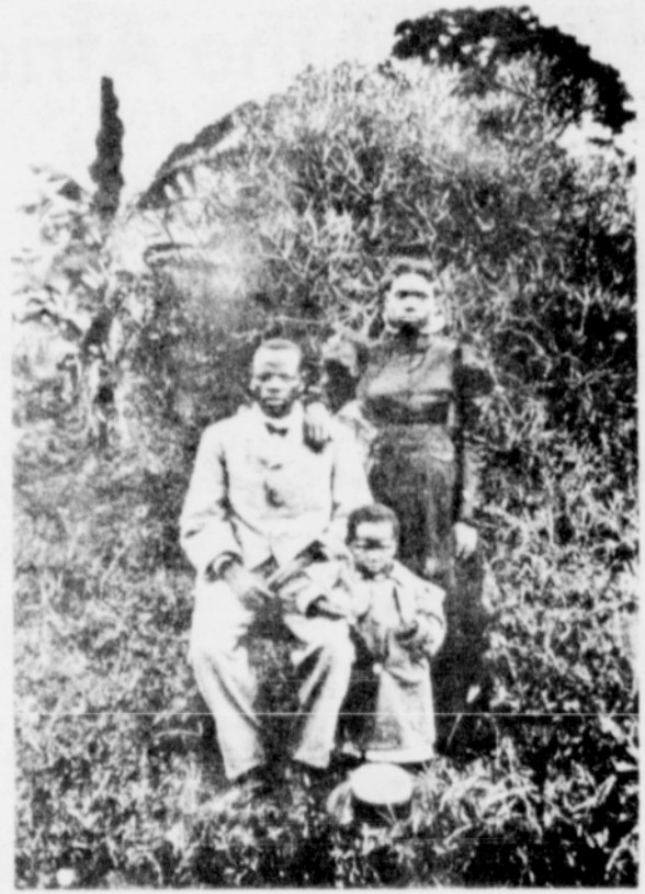
John Chilembwe and family, about ten years before the 1915 rebellion.

The phenomenal growth of the Baptist and Methodist denominations among Blacks is attributed to the high emotionalism involved in the evangelical form of Christianity which has done much to fashion the present form of worship.