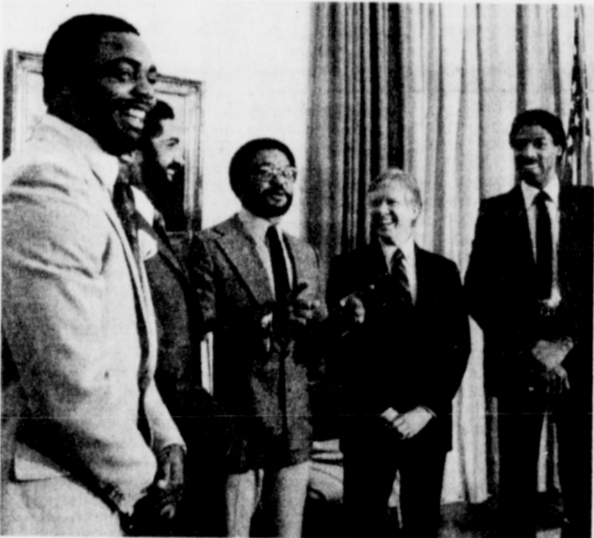
President Carter responds with laughter as Reggie Jackson makes a point during a recent meeting with, left to right: Dave Parker, Franco Harris and Julius Erving in the White House Oval Office. The four athletes met with the President to discuss his proposed youth initiatives program.