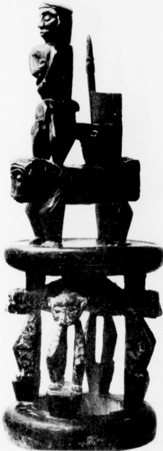
Chief's stool from western grassland area of Cameroon, Babanki-Kijum group. The stool is 31 1/2 inches high and is made of mahogany and charcoal coated.