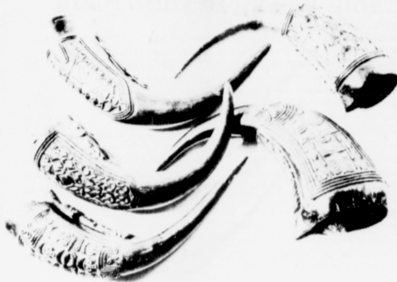
Drinking horns carved from buffalo horn from Cameroon.

We show you pictures of some art items you might see at the museum.