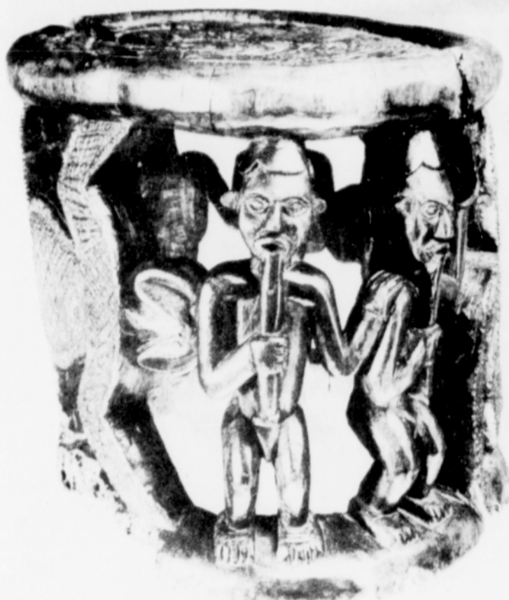
Commemorative stool from West Cameroon.