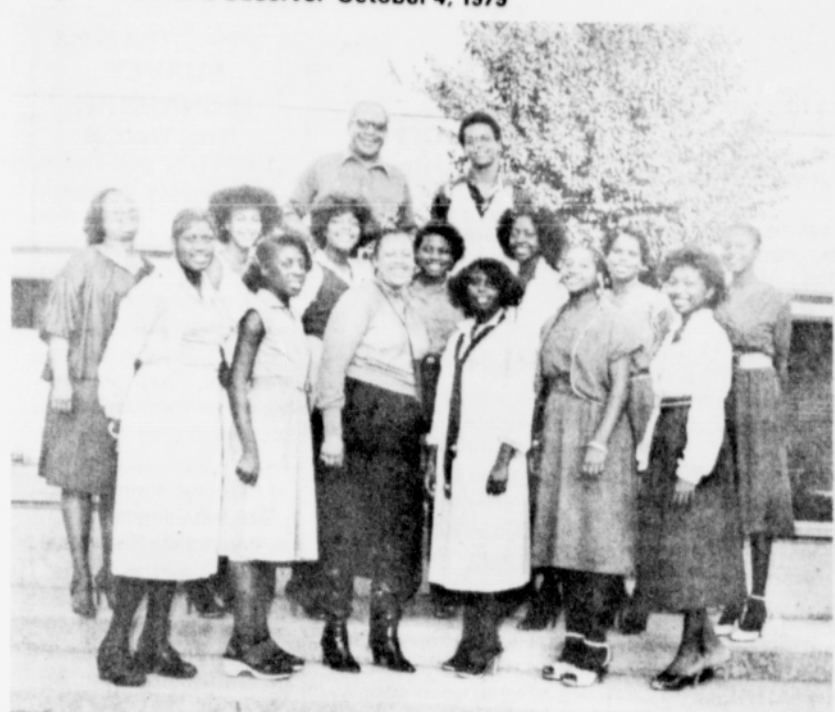
4-H Choral Ensemble