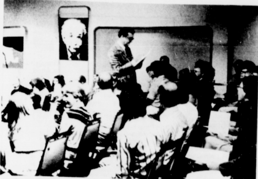
An audience selected to match the demographics of the Northwest joined with Steve Allen in Portland to tape audience participation segments for "Electric Energy Test"—a six-state regional network energy special to be aired September 12th. Television viewers in Oregon, Washington, California, Idaho, Montana, and Wyoming will be asked to take a family energy quiz while watching the show. Answer cards appear in this week's "Observer" on page 5.