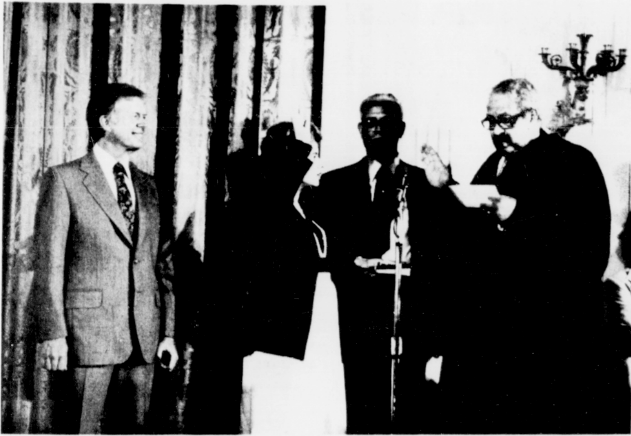
President Jimmy Carter looks on with a smile as Patricia Harris is sworn-in as Secretary of Health, Education and Welfare by Supreme Court Justice Thurgood Marshall in the East Room of the White