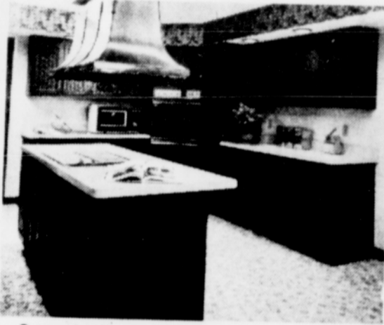
Sweeping lines, graceful styling and high performance highlights the new island rangehoods. Many units are available in hammered or smooth metals and finishes, from pewter to antique brass and copper. All HVI-certified.

If you plan carefully along the way, you'll have a room that's not only beautiful and inviting, but one that works for your family.