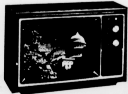
19" Magnavox Solid State Color TV

Buy a certificate of Deposit at American State Bank and receive a brand new Magnavox color set as your prepaid interest. It's like getting Instant Interest. Perfect for any room, these 100% solid state Magnavox color sets are built of durable high-impact plastic with a beautiful walnut grain finish. Compact in size, but big in fine performance and quality features, you'll enjoy your favorite programs in vivid color for years to come. Backed by full factory warranty and factory service, these sets are now on display for your inspection at both American State Bank offices. American State Bank invites you to choose one of the following savings plans and receive your Instant Interest in the form of a Magnavox color TV. Receive a color TV set for each certificate of deposit you buy.