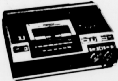
Magnavox 4-hour Video Cassette Recorder

The beautifully-designed recorder easily attaches to any television set — any size, any brand — and permits up to four hours of recording on a single cassette, making it more economical than conventional one- or two-hour units. The compact, lightweight recorder, which provides extremely sharp and color-true images, has convenient remote-pause control for temporary stops (editing out commercials, etc.). Also, you can watch one channel while recording a program on another. Or, set the built-in electronic timer to record a program when you're not there. The timer and recording will begin on schedule and cut off automatically when the tape reaches its end. The Magnavox video cassette recorder is on display at American State Bank. Open one of the following certificates of deposit and take a recorder home with you in lieu of interest.