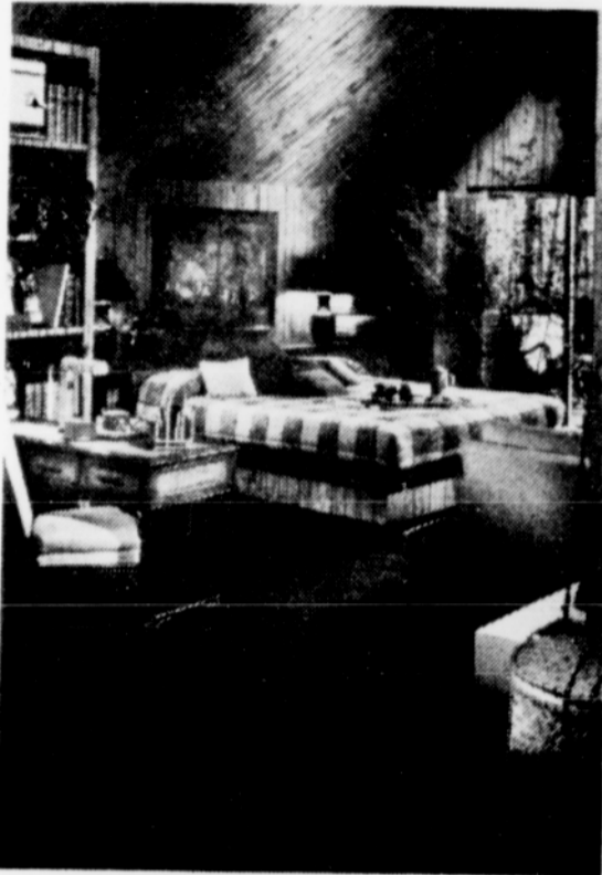
Oriental Serenity creates a bedroom for relaxing. "Forestflair" wall paneling creates a woodland background for comfortable furnishings. Affordable paneling can be installed by the do-it-yourselfer. Paneling is repeated on the base of the platform bed for a custom look.

How often have you browsed through home furnishings magazines, wondering how decorators manage to create such beautiful rooms?