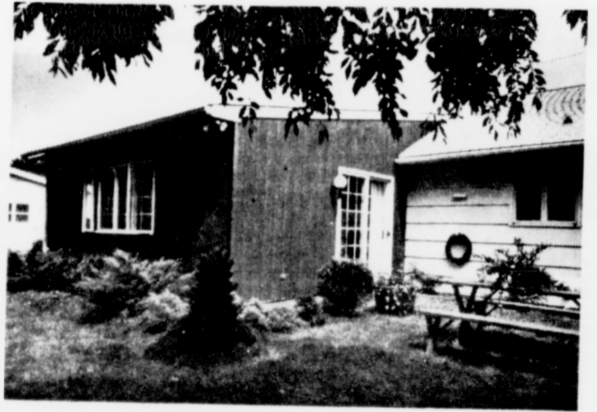
New room addition automatically adds market value to the home. Siding and roof shingles were installed after the basic structure was sheathed in construction-grade plywood and building paper. The homeowners chose a siding which they painted themselves. They also installed interior prefinished paneling and trim to the family room themselves thereby saving hundreds of dollars in labor costs. The textured plywood siding is painted a mellow, burnt-umber to contrast with the main house.

The large house is perfect for the growing family with children. But if all the space is not used, it can be an unnecessary burden in extra mortgage payments and taxes.