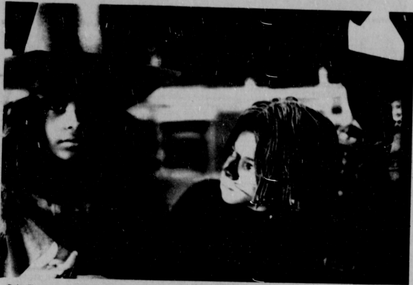
Boise Elementary School students dressed as characters of The Wizard of Oz for recent Book Parade.