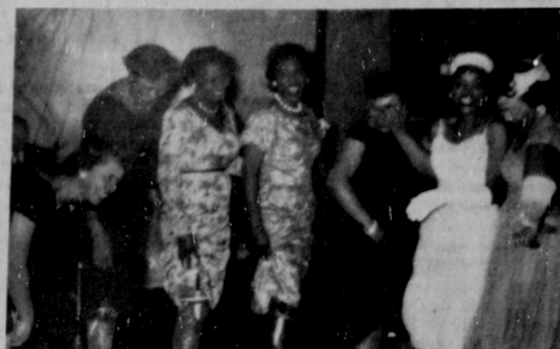
Bridgeteers New Year's Day Party.