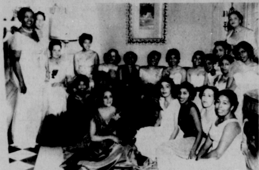
Deltas, Christmas 1955.