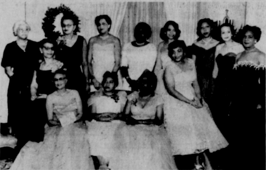
Delta Mothers, Christmas 1955.