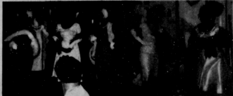
Bridgeteers New Years Day, 1959.