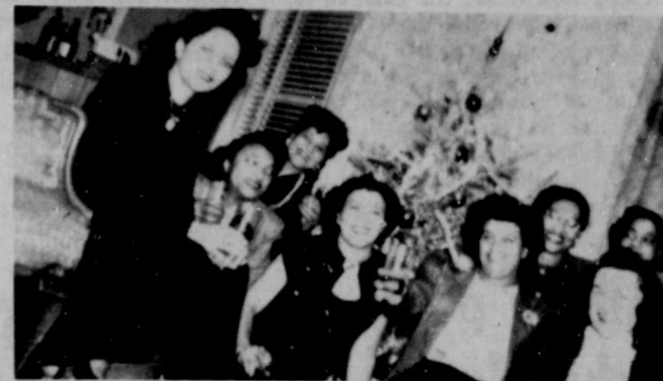
Friends get together during the Holiday.