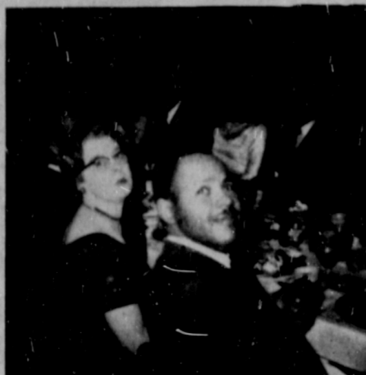
The Links, Inc.