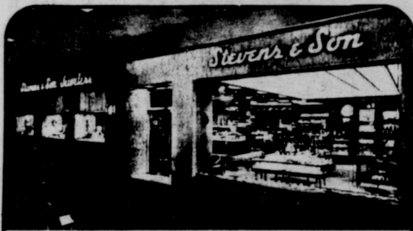
Lloyd Center Store

A fresh Christmas tree brightens the home and blesses the house with a fragrant evergreen scent.