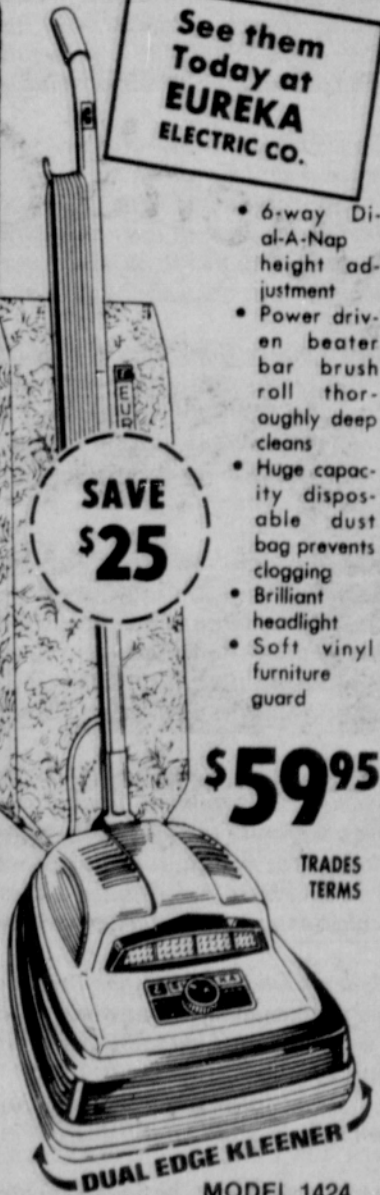
DUAL EDGE KLEENER MODEL 1424