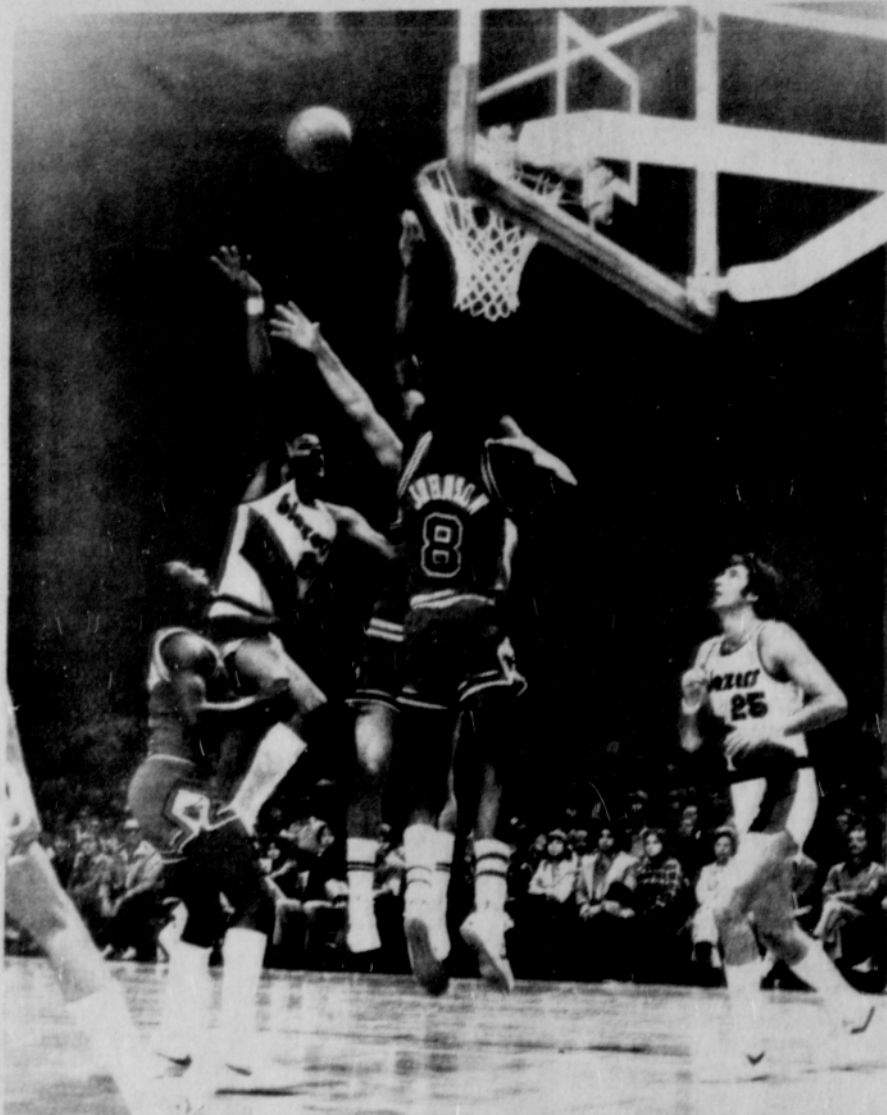
Maurice Lucas tosses a hook shot over the awaiting hands and arms of two Chicago Bull players during last Friday night's loss to the Bulls at Memorial Coliseum.