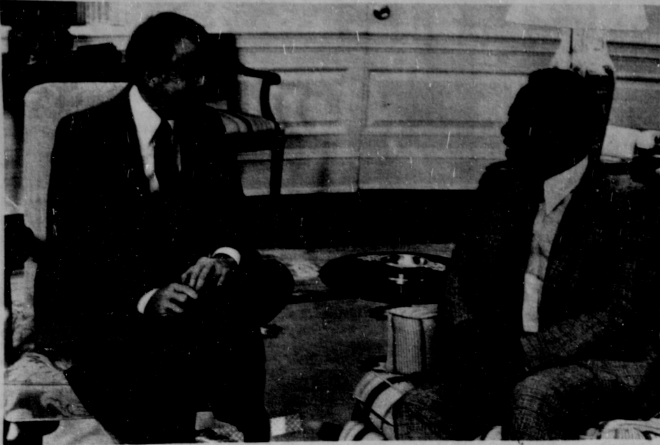
President Carter and baseball great Henry "Hank" Aaron met recently to talk over old times and future challenges in a session at the White House. Aaron — sometimes called "The Hammer" — was slugging home runs for the Atlanta Braves while the President was serving as Governor of Georgia.