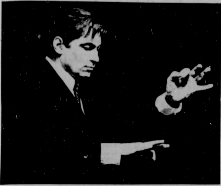
Internationally renowned theatre arts Master, Jacques Lecoq, appointed Chevalier of Arts and Letters by the Government of the Republic of France in 1974. He will present a One Man Show, followed by an informal discussion period. As host city for this unprecedented West Coast Event, Portland invites the public to attend. To be held at the Portland Art Museum, August 18th, 8:00 p.m. For reservations contact: ELANCO, P.O. Box 241, Portland, Oregon 97207 or telephone 225-0120.