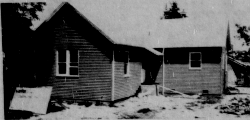
This house was rehabilitated for Portland Development Commission by VETS of Oregon, Inc., as a training project. The house, located at 4206 N.E. Garfield, will now be sold.