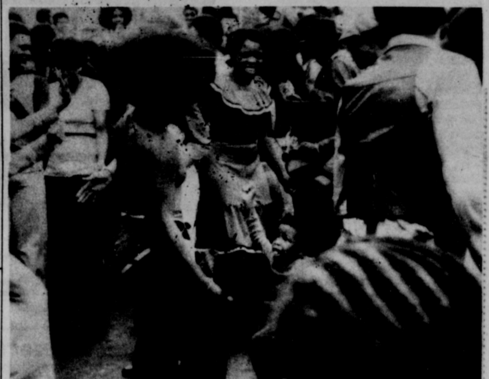
Music, dance and drama were prominent in community festival "Kintu," at which Albina murals were dedicated.