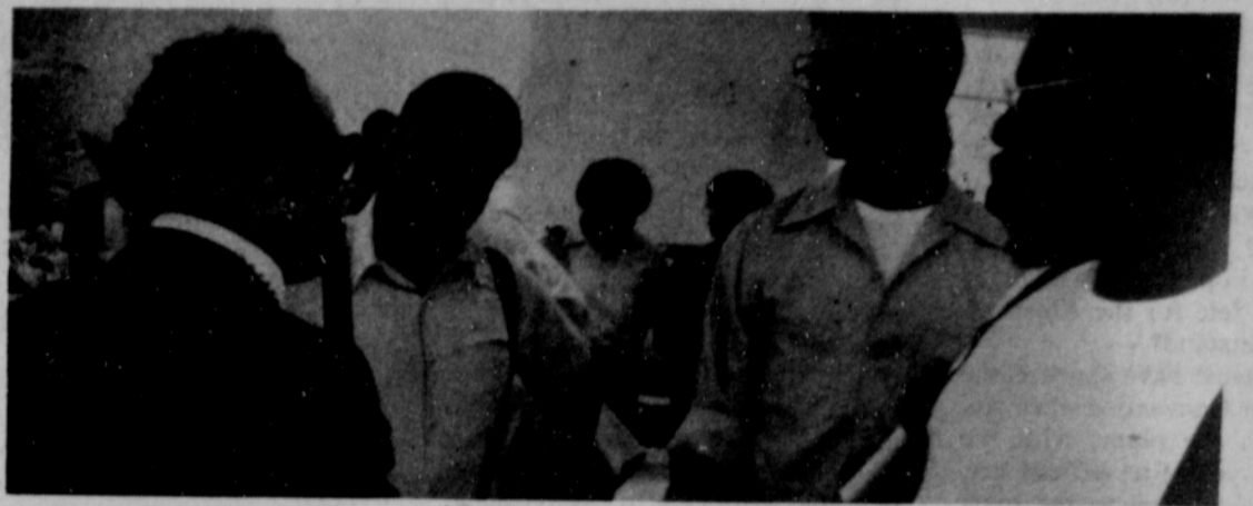
Hooks talks with OSP inmates.