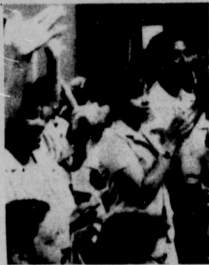
Delegates respond to Hooks' challenge - "Till Victory is Won".