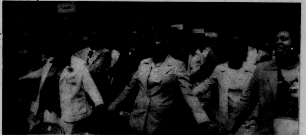
An inspiring chorus of "We Shall Overcome".