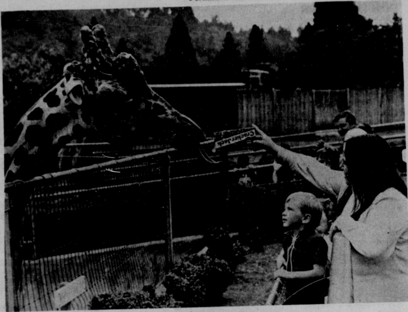
The world famous Washington Park Zoo boasts many exotic animals such as this hungry giraffe. The 39½ acre zoo is located in the west hills of Portland. Other well known inhabitants of the zoo include the large elephant collection.

Paid for by Committee to Elect Arwyn Barnes.