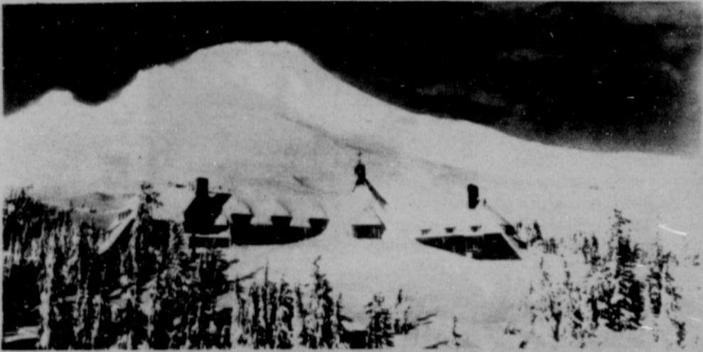
Mt. Hood's Timberline Lodge stands at the 6,000' level, where it is accessible the year-round.

The Cascade Mountains, are complete with glacier-capped volcanic peaks — Mt. Hood, Jefferson, Washington, the Three Sisters, Three Fingerted Jack, McLaughlin, others.