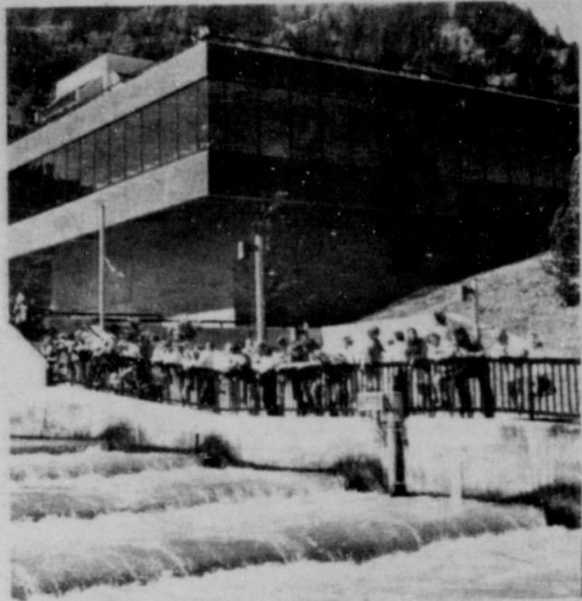
Visitors to the fish ladders at Bonneville Dam try to catch a glimpse of migrating salmon. Fish are more easily seen at the underwater fish viewing windows in the modern visitor center, open every day.