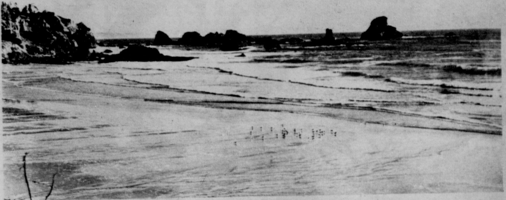
Views of impressive coastal seascapes are offered from Ecola State Park. Sheltered Indian Beach, shown here, is a favorite for swimmers