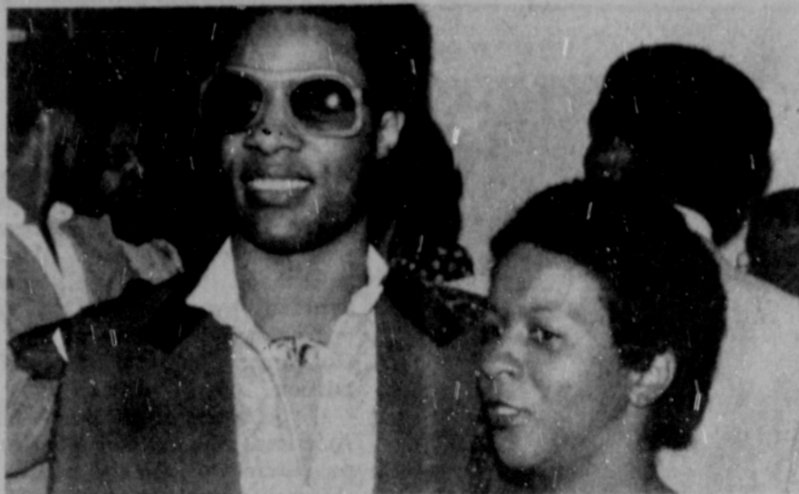
Stevie Wonder and friend.