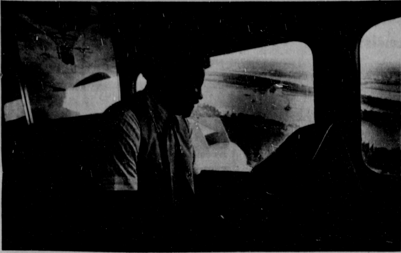
Al Williams of the Observer staff, enjoys the view of the Columbia River from the Goodyear blimp.