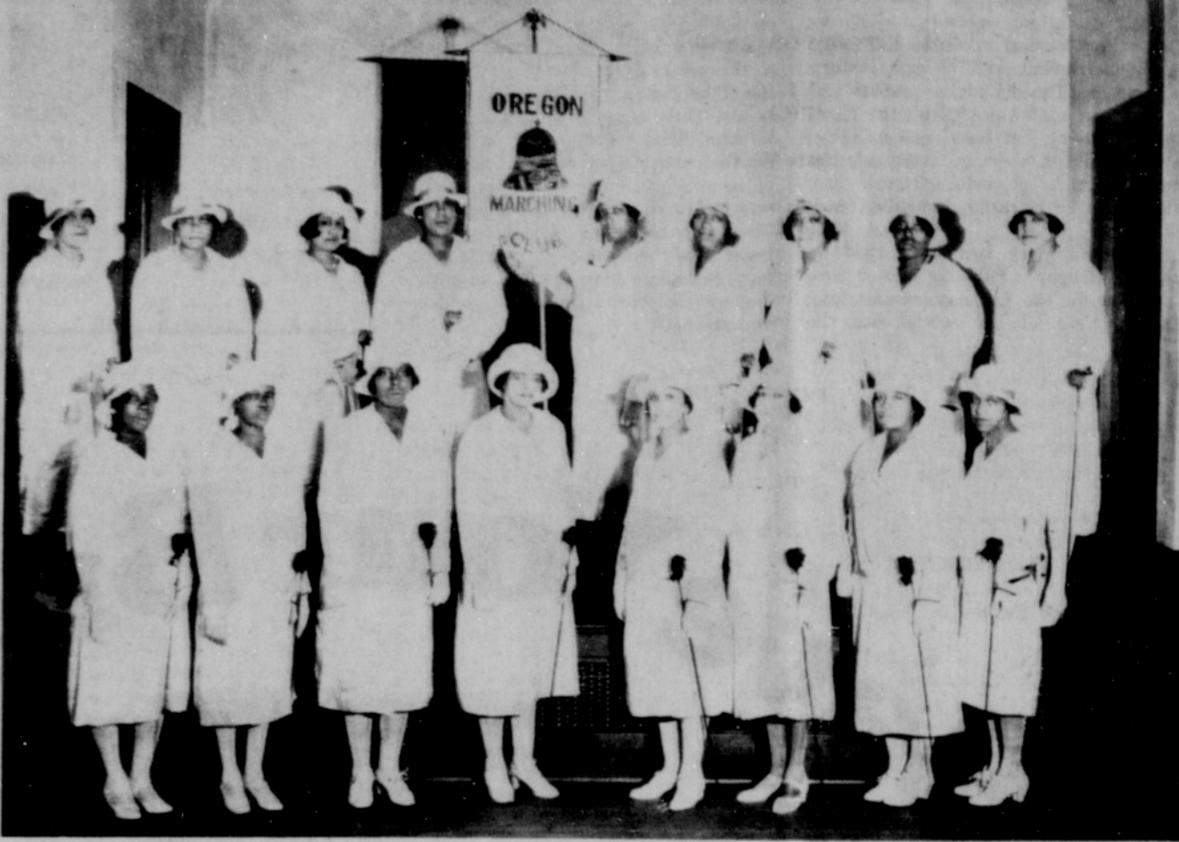
"Lady Elks Marching Team" - participated in the 1927 Rose Festival Parade.