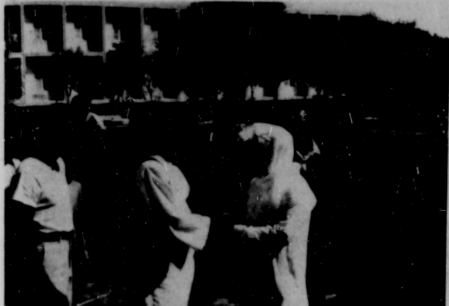
Emam Wallace D. Muhammad, leader of the World Community of Al Islam in the West, greeted pilgrims from around the world.