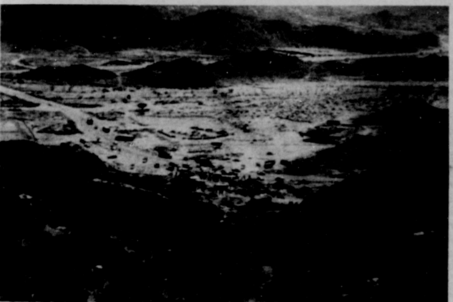
The view from the Mount of Revelation, climbed by participants in the Haijj.