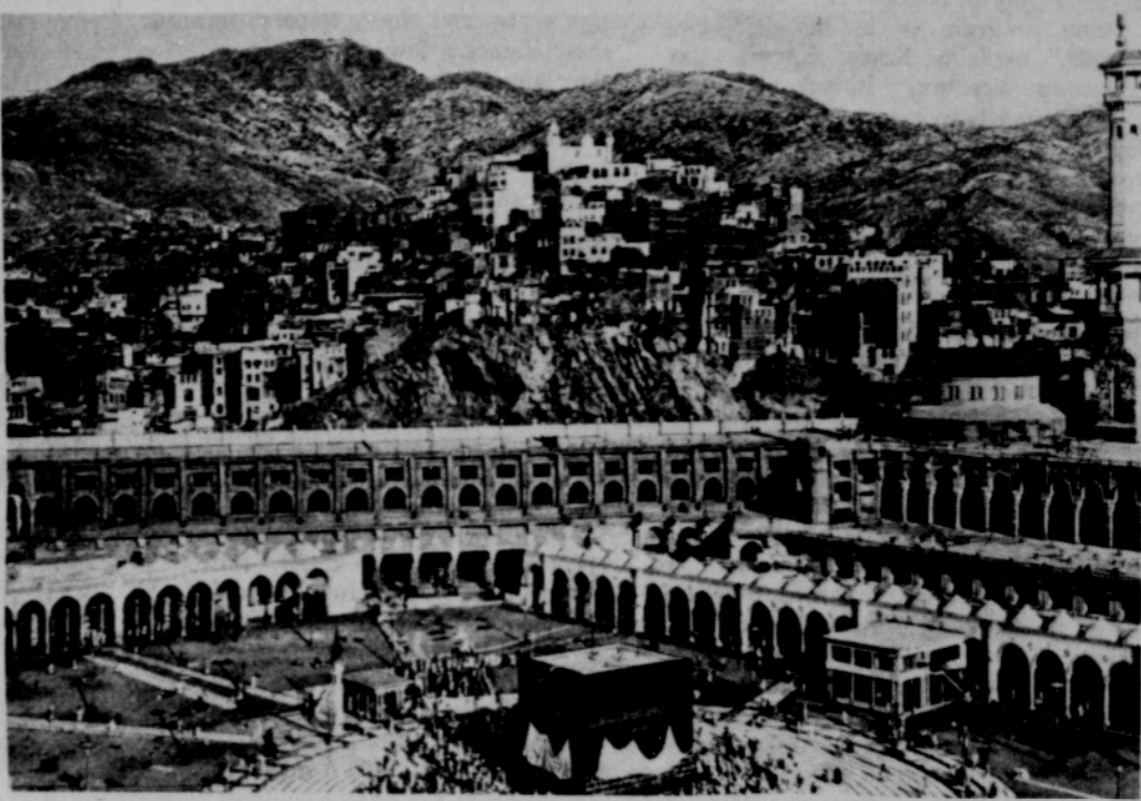
In the foreground, the Kaaba, which houses the remains of the house built by Abraham. Surrounded by the Masjid Al Harem, in Mecca.