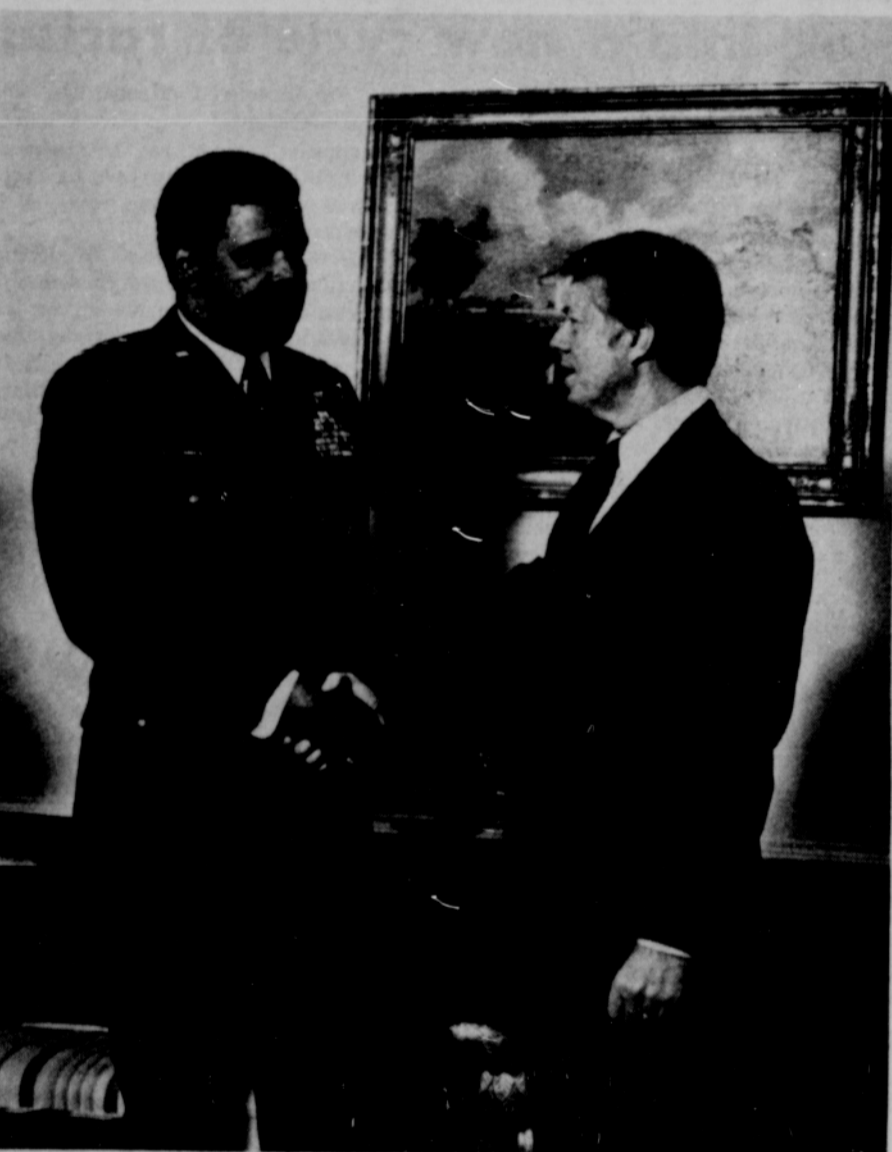
General Daniel "Chappie" James, Jr., the first and only Black American four-star military officer, shakes hands and talks with President Carter - his Commander-in-Chief - at the White House on a day of ceremonies marking James' retirement.