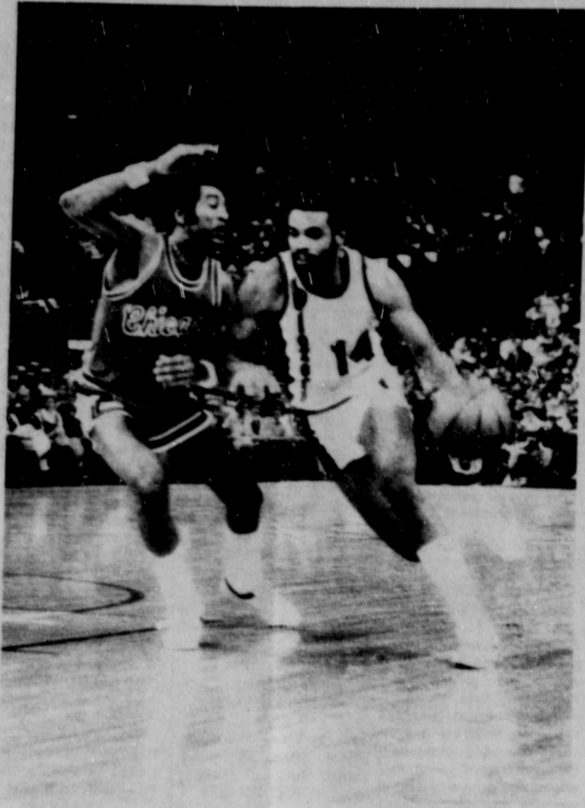
"Train" arrives...Hollins drives past the pesky Norm Van Lier in Blazer win over Bulls.

Johnny Davis now leads Blazer "regulars" in foul shooting at .829. Davis has averaged 15 points a game in his last four games and now is 9.8 for the season. He is closing in on being the seventh Blazer averaging in double figures.