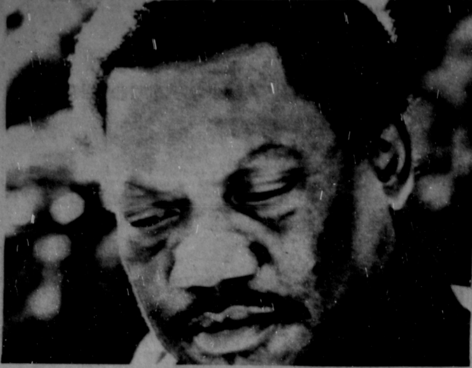
BOBBY BLUE BLAND