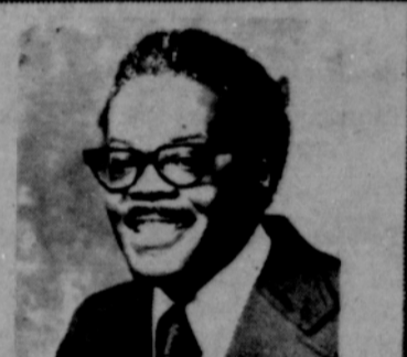
CAL TORAN Home 289-0839