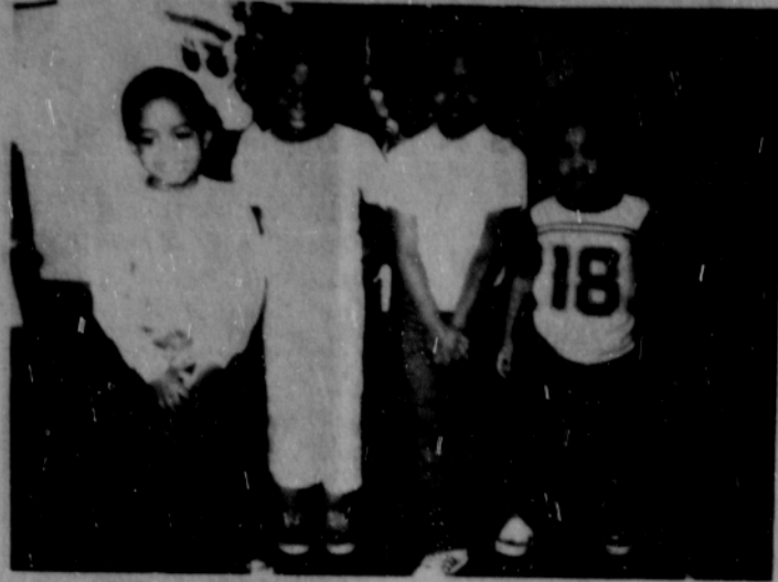
The Albina Ministerial Alliance Day and Night Care Program provided gifts and Christmas stockings for the children it serves. The program provides child care for infants and small children, in private homes.