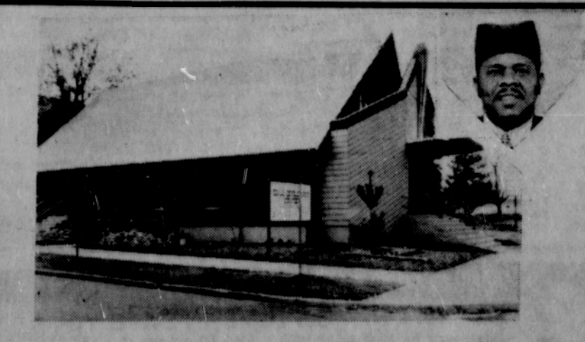
You are Welcome to Worship at

I'm a prisoner of yours But I'm not chained or bound Your good loving makes me stick around