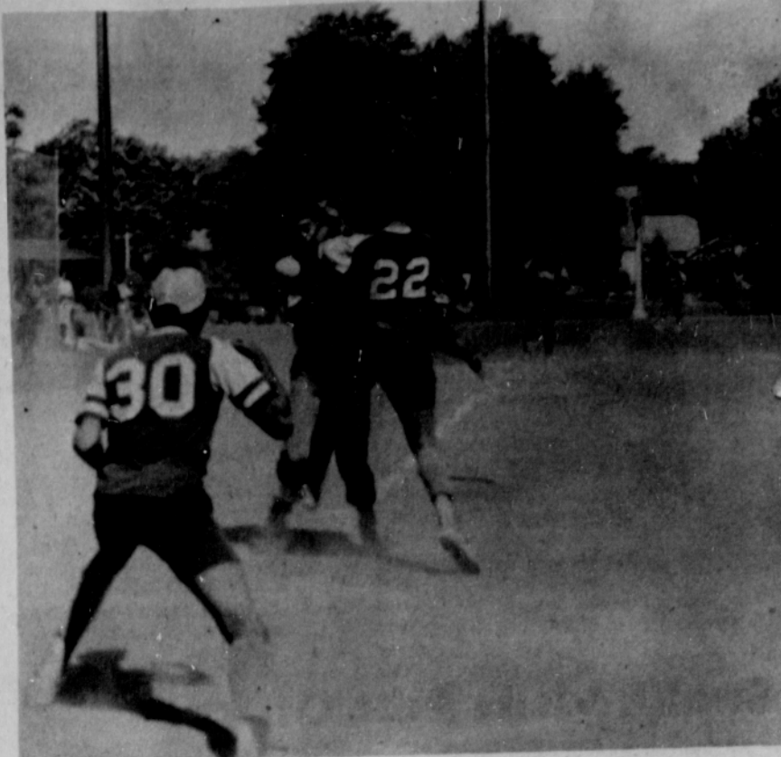
Caught on the basepath and no run scored, as Love Train fought to widen their lead over the Pits.