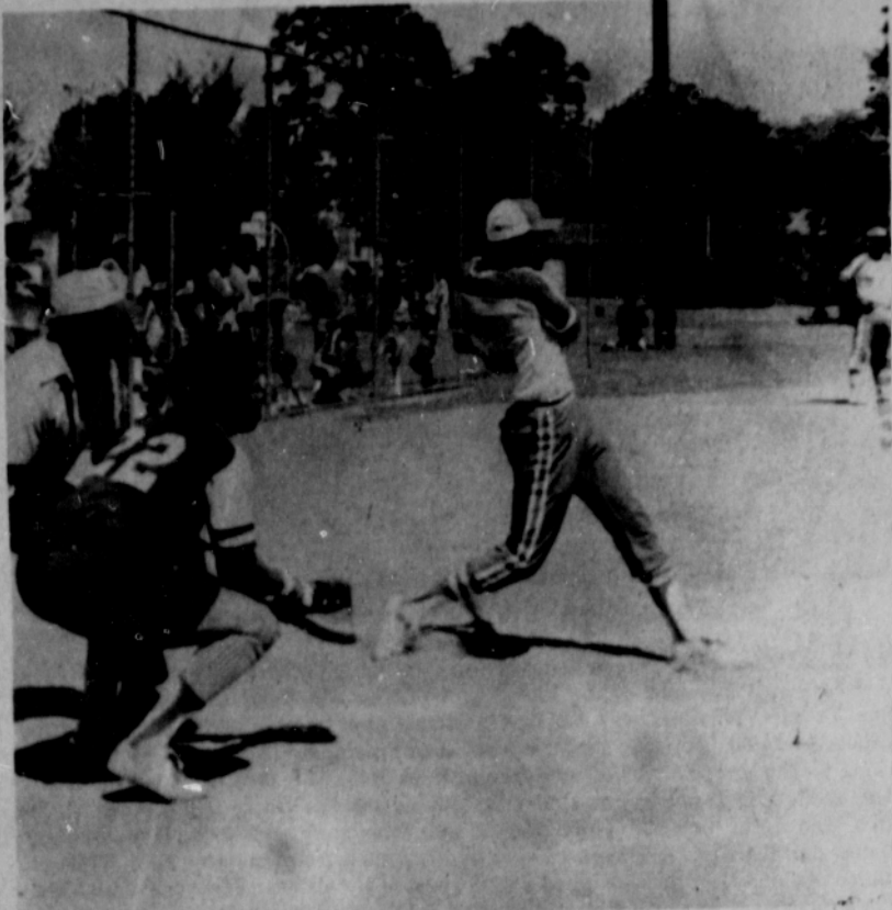
Fast action was seen at All-Ghetto Mushball Tournament. Love Train and the Pits battled for a chance to meet Geneva's for the championship.