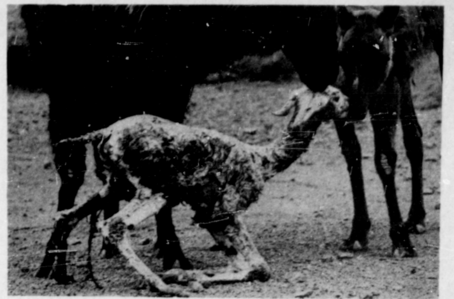
"Onyx", llama at Portland Zoo, encouraging baby "Frecklet" to stand moments after birth. Curious onlooker is "Topaz", female friend. "Freckles", the father, was unimpressed with his namesake's arrival and remained out of camera range.

Qualifications: 4 yrs. of full-time exp. in environmental sanitation, at least 2 of which are related to subsurface sewage disposal; graduation from a 4 yr. college or university with specialization in public health sanitation, or related field; or a satisfactory combination of education and exp. Starting pay: $1,225 to $1,550. Last day to file: June 18, 1976. To apply: contact Department of Coordinated Services, Personnel Office, Jackson County Courthouse, Medford, Ore. 97051.