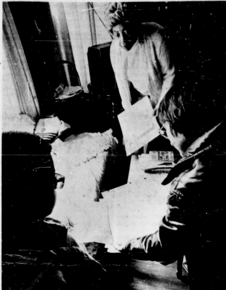
The year long project, funded by a Teacher Incentive Program grant, included collecting and portraying the history of the Albina area by the students through oral history, collecting pictures, drawings, a slide presentation, a mural and other mini-projects.