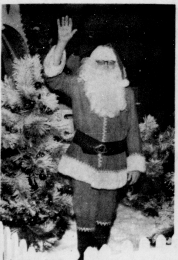
Santa's at the Center -- better be good. Santa Claus greets kids of every age at Jantzen Beach Center.