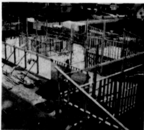
King Neighborhood Facility is seen during construction. Funded by HUD, the center will house a variety of social agencies. Mayor Goldschmidt and other officials held opening ceremony on October 6th. (See page 1)