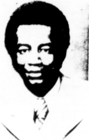
This young man was delivered from the clutches of drugs, from sin to salvation. Hear this dynamo for Christ.

At the Community Church of God 202 N.E. Skidmore St. Sunday, April 20th 11 a.m. & 7 p.m. Wed. - Fri. April 23 - 25 7 p.m. nightly.