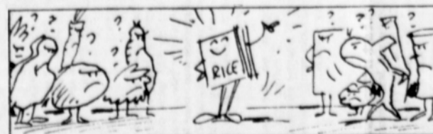
In southern China, as in Burma and Siam, rice is the central food, and all else—soup, meat, fish, vegetables and condiments—are "garnish."

Individual works may be purchased. The exhibit is being circulated by Old Bergen Art Guild, Bayonne, New Jersey. The public is invited to this exhibit free of charge.