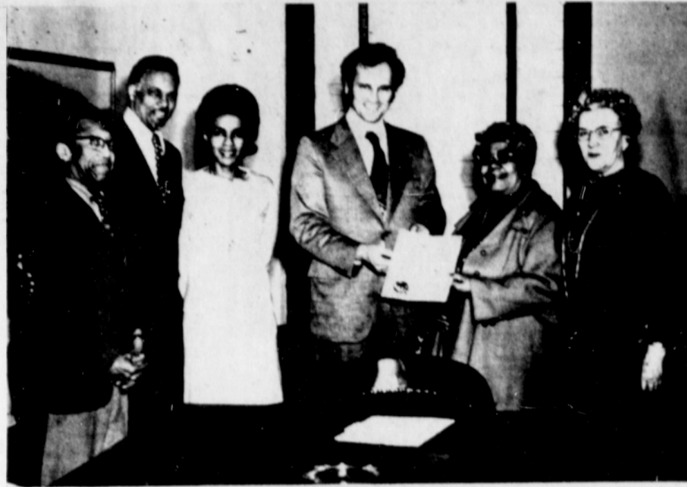
Mayor Neil Goldschmidt recently proclaimed the week of February 10-17, 1974 as NAACP Birthday Week, in commemoration of the 65th anniversary of their founding.