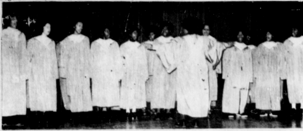
Students of Monroe High School present Black Culture program for classmates.