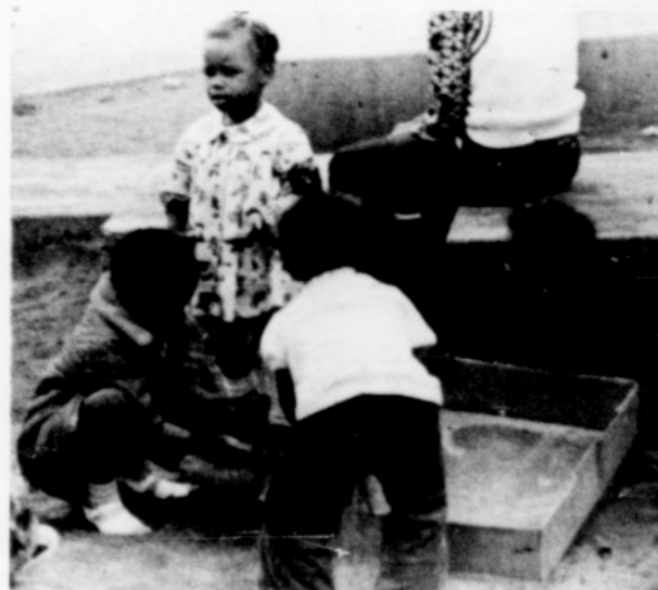
Model Cities Child Care Centers are taking applications for fall enrollment. Call 288-8861