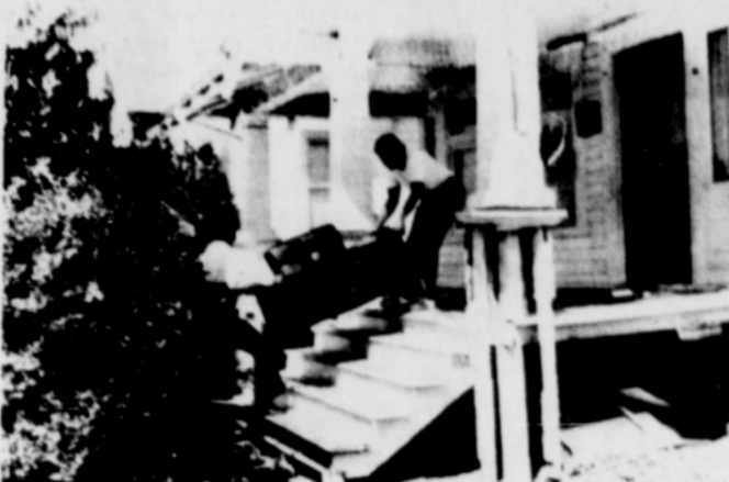
Neighbors remove furniture from house in the path of fire that destroyed a pool hall and two garages and damaged the house and Harris Automotive.