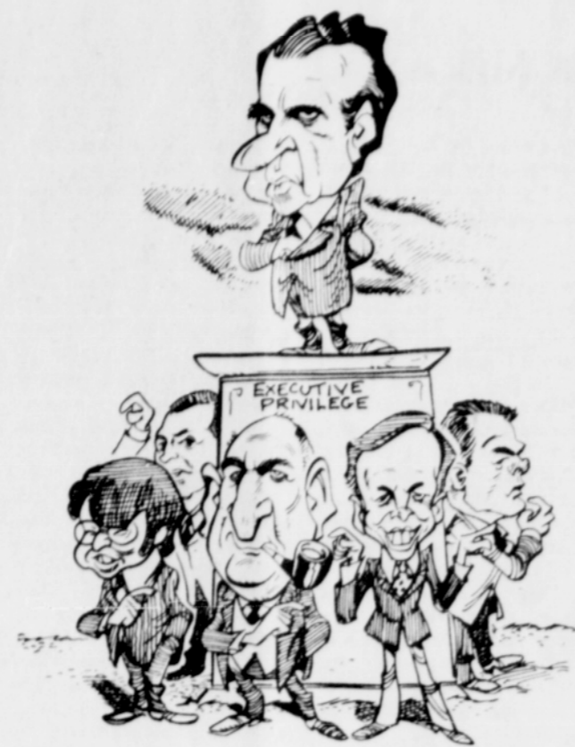
"The man at the top must bear responsibility."