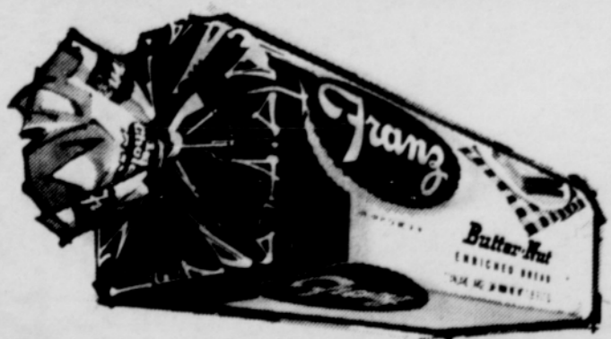
the good Bread