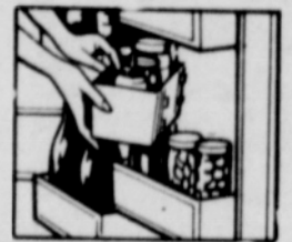
"Porta-Bin" Door Storage

20.7 Cu. Ft. NO-FROST REFRIGERATOR with HUGE FREEZER